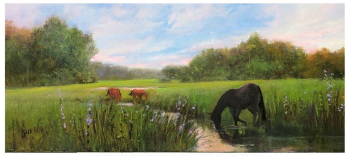
RISING STARR HORSE RESCUE PAINTING FUNDRAISER

ON SITE AT THE FARM 93 Silver Spring Road Wilton, CT 06897