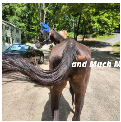
BRANDY on intake